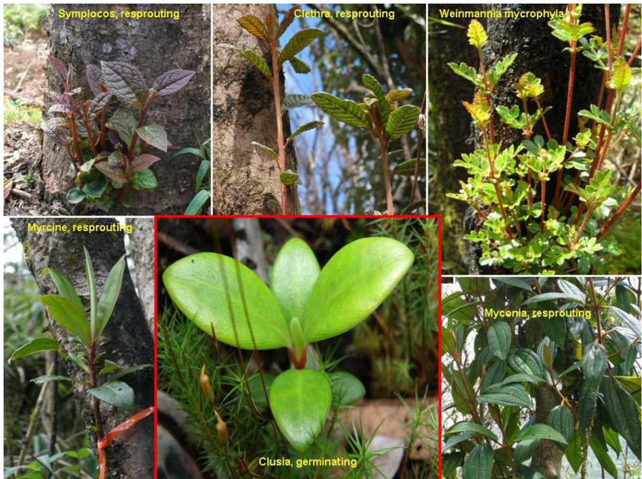
Fig. 3. Burned Montane Cloud Forest resprouting after the severe 2005 fire season. Plots were established in 2008 at the buffer zone and protected area of the Manu National Park, in the southern Peruvian Andes.