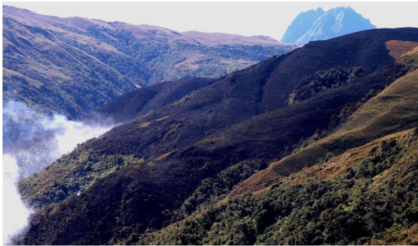
Fig. 1. Puna fire moving down towards the surrounding cloud forests in the buffering area of the Manu National Park, Peru. Nearby slopes display an anthropogenic mosaic of TMCFs and Puna, where fire has resulted in a retreat of the treeline.